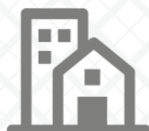
High street firm

High street firms provide the greatest opportunities to become a partner for: